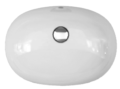
Drain not provided